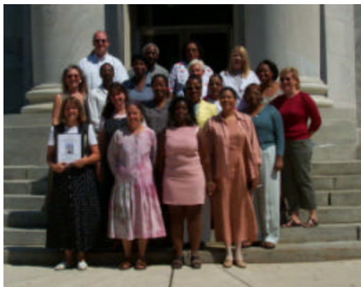
FIGURE 2 WORKSHOP PARTICIPANTS AND LEADERS

participants and workshop leaders taken on the final day of the workshop.