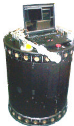
FIGURE 3. ROBOTIC WALKER AS CONFIGURED BY SEMESTER END.

By semester's end, this group had developed the working robot walker illustrated in Figure 3 that integrated two haptic devices, a control system, and a laptop for graphical interface with the XR4000. They had also conducted preliminary user testing with five able-bodied, young adults between 20 and 30 years of age. These respondents indicated feeling safe operating the robot walker, despite its large size, yet required brief instruction to operate the haptic devices and faulted its maneuverability because of its inability to move in reverse.