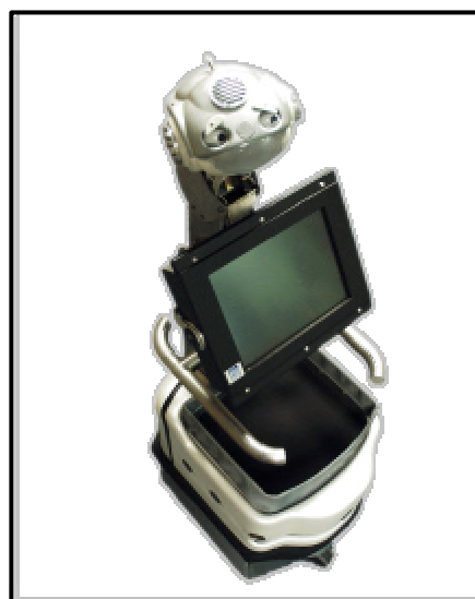
FIGURE 1. PEARL, THE CURRENT NURSEBOT PROTOTYPE.

Throughout the semester, students engaged in a variety of activities with Pearl, depicted in Figure 1, one of two prototype robots created for the Nursebot Project. Pearl "is equipped with a differential drive system, two on-board Pentium PCs, wireless Ethernet, two SICK laser range finders, sonar sensors, microphones for speech recognition, speakers for speech synthesis, touch-sensitive graphical displays, actuated head units, and stereo camera systems...On the software side, Pearl features off-the-shelf autonomous mobile robotic navigation systems, speech recognition and speech synthesis software, fast image capture and compression software for online video streaming, and face detection and tracking software." Pearl also has software modules that assist with reminding tasks and navigation [2].