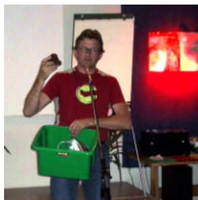
FIGURE 6. VIAFANTASIA Ltd. PERFORMING “IDEA SWARMING”

The project has shown that entrepreneurship programs out in the schools as a part of the ordinary teaching is necessary to create a new generation of entrepreneurs, and that “idea swarming” is popular among the pupils.