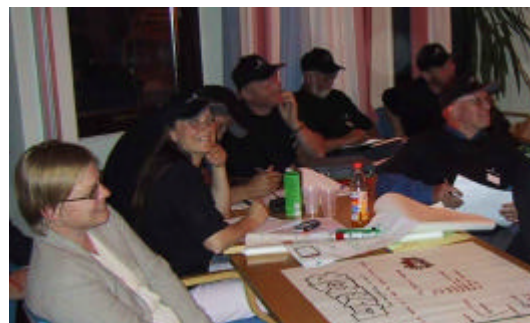
FIGURE 2. PROJECT GROUP PARTICIPANTS UNDER THE 12HR CAMP