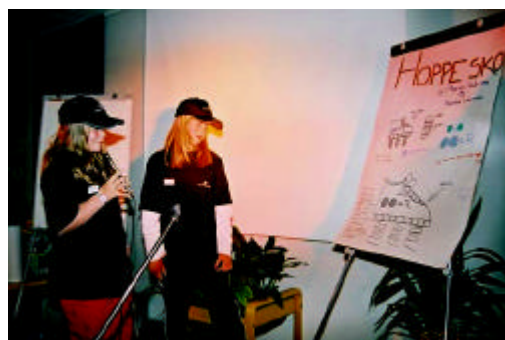
FIGURE 9. ELEVATOR KICK OFF