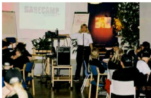
FIGURE 8. LECTURE IN ENDURANCE

The exercises were delivered to a jury. In the evening a female role model in endurance, presented her way off life and the struggle to succeed, and the taste of success.