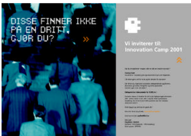
FIGURE 5. INNOVATION CAMP MARKETING POSTER

Since the Innovation Camp program was totally new, it had to be extensively informed about, and the marketing campaign had to be professional and directed towards the youths. Information to teachers and school administrations was sent out by the National education Office and by Young enterprise Norway. 120 teachers were directly informed on an entrepreneurship conference in Østfold county April 3, and information material and posters was handed out to them. GRIFF marketing company designed a “sharp” poster and marketing campaign, directed towards teenagers. Se Fig.5. This poster was very provocative towards older people, especially men in grey suits. Some few teachers refused to display the posters at the school...! The text translated reads: “These can’t create a shit, can you?”