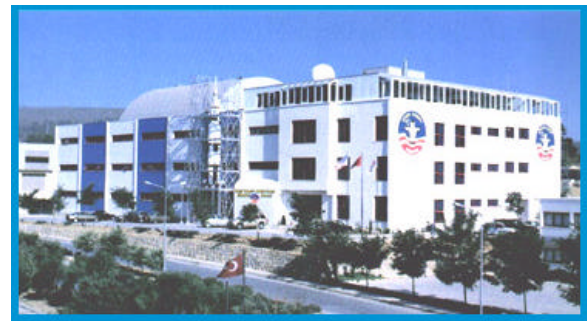
FIGURE 4. SPACE CAMP TURKEY

Turkey has also a big “Space Camp” centre to motivate young people to study technology science, se FIG 4.