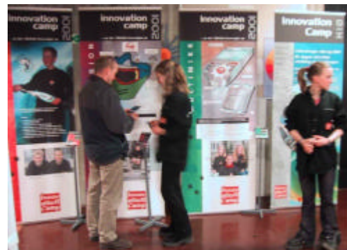
FIGURE 12. INNOVATION CAMP AT EXHIBITION

In November all of the marketing gear was ready to use, and the pupils was trained for the big challenge, present their products for leaders in industry and government at the “National congress for entrepreneurship” . All groups had 300 brochures each to deliver out, uniforms and big posters. For two days they had to “be on stand”, the longest day for 10 hours.