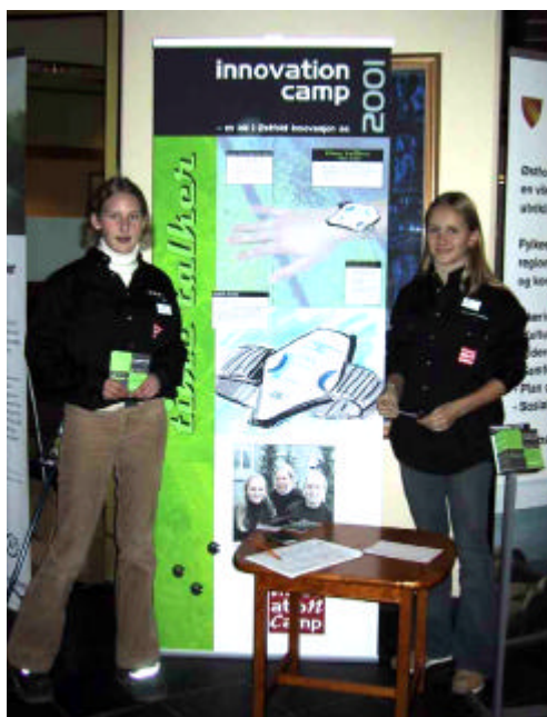
FIGURE 1. PUPILS PRESENTING THEIR PRODUCT IDEAS AT EXHIBITION

Abstract 3/4 Innovation Camp is a one-year program aimed at motivating pupils in primary, secondary and high school to develop new products for the companies of the future. This program is developed by Østfold College of Engineering in Norway, financed by “The ministry of local government and regional development” (Kommunal og regional departementet, KRD) and several others. Innovation Camp involved 900 pupils at 12 different schools in the county of Østfold. These pupils participated in an innovation process carried out in the spring of 2001, and 75 of these pupils was picked out to go through a 12hr non-stop contest. 28 pupils with 11 ideas in the age from 10 – 18 years were rewarded. A professional marketing company gave the pupils help, producing Internet pages, brochures, and roll-ups. Later on all of the products was design protected by “the Norwegian patent office”. At last, the 28 winners presented their ideas for media and public at “The national conference of entrepreneurship”. This boosted the pupil’s self-confidence in a way that no classroom could teach or give them. The girls dominated with 18 of 28 participants, a total of 65% female participation.