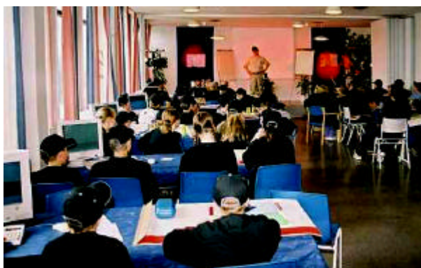
FIGURE 7. INNOVATION CAMP SCENE OFF ACTION

The climax was carried out on the 6th. of June 2001, when 75 pupils from primary, secondary and high school met at the Østfold College of Engineering to carry out an 12hr. long contest to refine and develop their ideas further. Specialists in different areas were gathered to help the pupils through the contest. The camp started out with an “idea swarming” and an innovative learning process. After this different lectures were given, and after each lecture different exercises and problems was to be solved. The participants ranged from 10 years up to 18 years, and they were mixed together in groups of 8 to stimulate collaboration and development of new ideas and products, se Fig.7. Every group was equipped with computer and Internet connection. All of the participants were given T-shirts and a cap to create a spirit of community. Food was served three times, and the contest carried on for 12 hours without a stop.