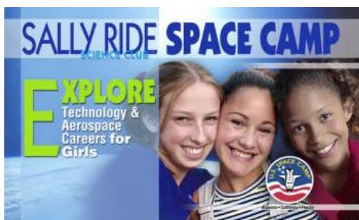
FIGURE 3. POSTER FROM US SPACE CAMP PROGRAM

Space Camps is spread all over the world as a part of national programs with huge budgets and sophisticated exhibitions and scientific instruments.