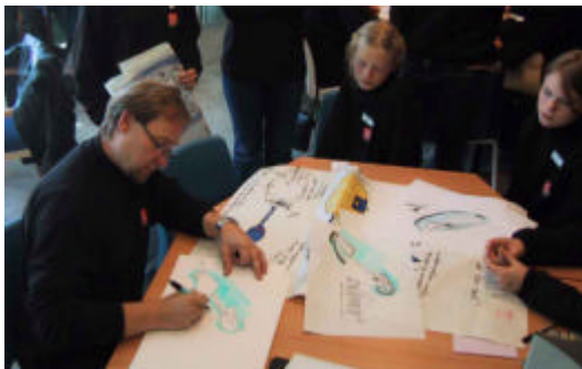
FIGURE 10. ARTIST DRAWING OF PRODUCT DESIGN

Winners of Innovation camp belonging to secondary and high school was picked out to present their ideas at the “National congress for entrepreneurship” in November. The project group was afraid that pupils from primary school were to young, and to be on “Stand” for three days was to much for them. A marketing company, Markedspartner Ltd, was hired to produce folders, roll-up and web pages for the pupils during a one-day long workshop. All off the idea owners was given a experienced godfather from the college to help them during that day. Everything had to be finished that day, and if someone did not, the result was printed in any case. This motivated the pupils enormously, and everyone finished text and design on time. Professionals in design drawing and computer aided design was used