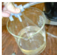
Figure 4: Typical sampling port

Plumbers' sanitation fittings were used for all connections. A typical sampling port at the outlet of each column is shown in Figure 4. The removable access ports on each of the columns was tapped and fitted with a 3/8" npt, 1/4" barb fitting. Glass wool was placed on the inside of the access ports to prevent column media from exiting with the effluent.