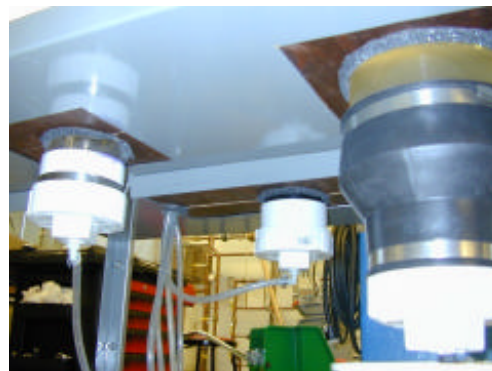
Figure 6: Cart bottom shelf showing how columns are held laterally in place

The support system for the reactors underneath the cart bottom is illustrated in Figure 6.