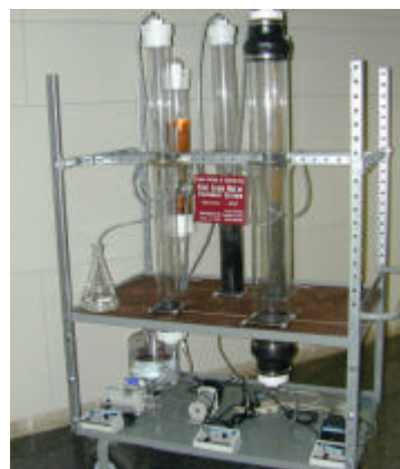
Figure 7: Pilot Scale Water Treatment System

After the columns were given a support structure on the cart, 4" plumbing fittings were permanently affixed to the plexiglass columns with standard plumber's cement. The entire lab-scale finished plant is illustrated in Figure 7.