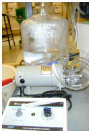
Figure 3: Chlorine Pump Connection

required chlorine dosage added to the column is 0.6 mg/L. The feed tubing is tee'd into the feed line, which connects the outlet of the ion exchange resin column to the chlorine disinfection column. This is illustrated in Figure 3.