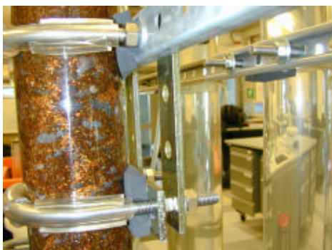
Figure 5: Upper Mounting System for Reactors

The entire plant was placed in a 2-ton pneumatic wheel cart (C&H Supply). To hold up the columns, a superstructure above the cart using steel runners was constructed. To provide lateral support, a hole for each column was bored in a solid piece of plywood, which would rest on the top shelf of the cart (Figure 5).