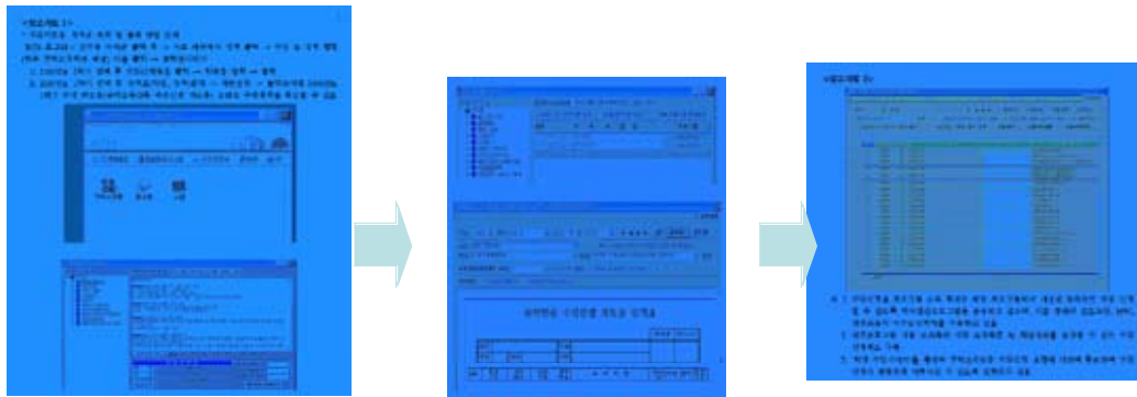
[Figure1] Course Application Procedure