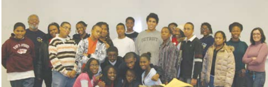
Figure 2. DAPCEP students for Fall 2008 Session, with two Mentors and Faculty Advisor.

Variations of the Program Design: Schedule variations have occurred over the years, with some schedule items left to the WIMS Program Coordinator. One Spring had a field-trip to the Center of Science and Industry Museum; another Spring had a field-trip to the Ford Museum. During earlier Springs (2005 to 2007), students constructed and took home an array of seven-segment light emitting diodes (LEDs) to write his/her name or write arithmetic expressions (add to divide). In the most recent Spring 2009 program, Saturday 5 included a closing program with parents and families invited. During both Spring and Fall 2008, there was no closing program.