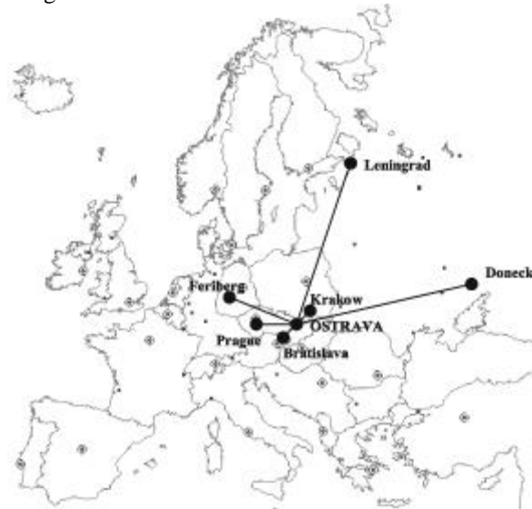
Fig. 1 Co-operative network of the VSB –Technical University in the field of Hydrogeo-logical and Environmental sciences (before year 1989)

awarded a grant from the European Union’s overall PHARE budget with the contract N° JEP 8300.