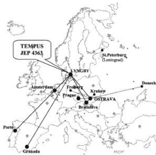
Fig. 2 Co-operative network of the VSB –Technical University in the field of Hydrogeological and environmental sciences (TEMPUS JEP No. 4363, 1992-95)

In project contract the objective "to create new curricula in the Environmental Hydrogeology" was accented as a main objective of the JEP. The project was planned for three years duration.