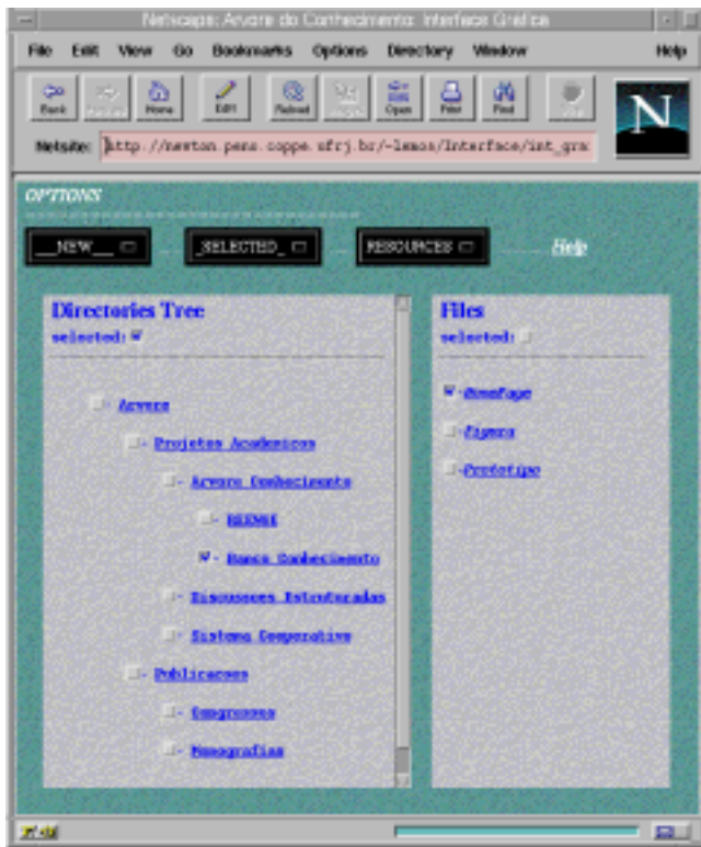
Figure 1. Remote Knowledge Repository Interface

The following figures present the Interface of the Remote Knowledge Repository prototype and some of its functional mechanisms. Figure 1 corresponds to the main interface, where the left frame presents the directory tree, i.e., the structure of the repository. The right frame shows the units of a selected part of the directory tree. Clicking over an item, its contents are presented in another pop-up window. The top frame of the interface presents the prototype commands and an online help.